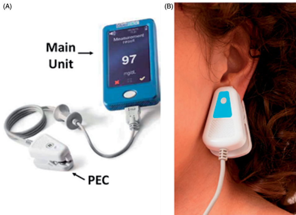
Figure 1. GlucoTrack non-invasive monitoring device. A. The device includes a main unit and three different sensor pairs, one per each of the three technologies, all located at the tip of a personal ear clip (PEC). B. Illustration of glucose measurement performance using GlucoTrack. The PEC is clipped to the earlobe for spot measurement.

The study involved two to three non-consecutive days of sampling in the course of one month. Each trial-day continued for 8 to 10 hours (between 8:00 AM to 6:00 PM) and included about 16 simultaneous paired measurements with GlucoTrack and HemoCue. On each trial day, subjects received meals and fruits in order to produce variability in their glucose profiles. Paired GlucoTrack-HemoCue measurements were taken before and between 30 to 210 minutes after food consumption [12].